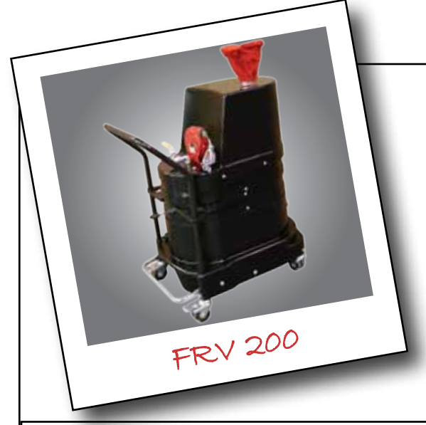
Accessory Package Includes: Vacuum Hose: 2" x 25', Urethane, Static Conductive, Smooth Bore Hose; Wand: 45", Stainless Steel, Single Bend; Crevice Tool: 15", Stainless Steel; Floor Tool: 20", Aluminum Cast w/ Rollers, Rubber Strips; Hose Connector: 2" Male End.